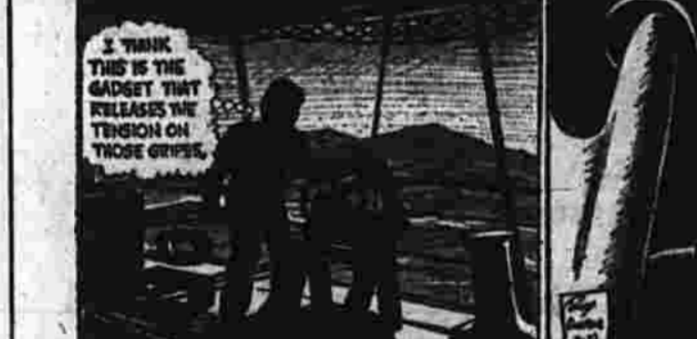
MICKY FINN BY LANK LEONARD