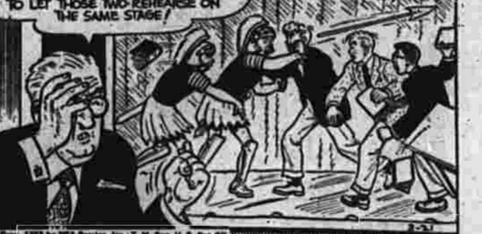
COMPETITION BY MERRILL C. BLOSSER