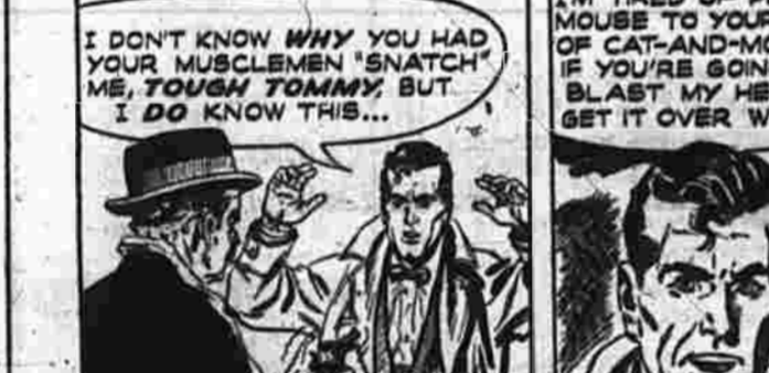
KEN WINSTON BY JERRY SIGEL AND MIKE ROY