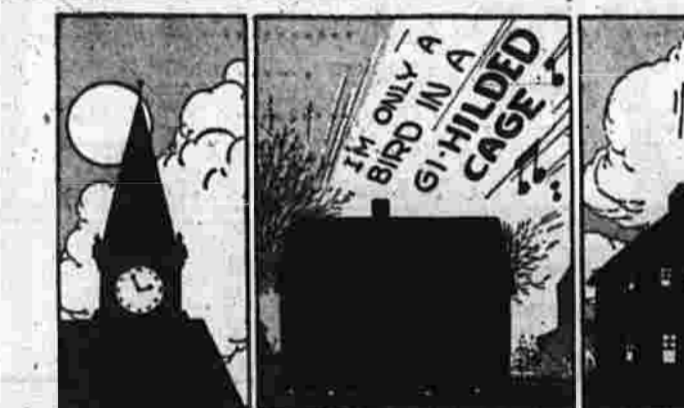
BOOTS AND HER BUDDIES