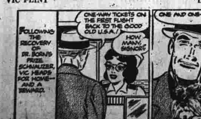
FOLLOWING THE RECOVERY