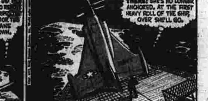
A GALLANT! BY MERRILL C. BLOSSER