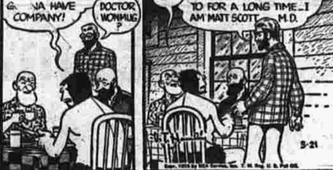
DR. SCOTT? BY V. T. HAMLIN