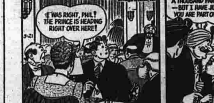
PRECKLES AND HIS FRIENDS