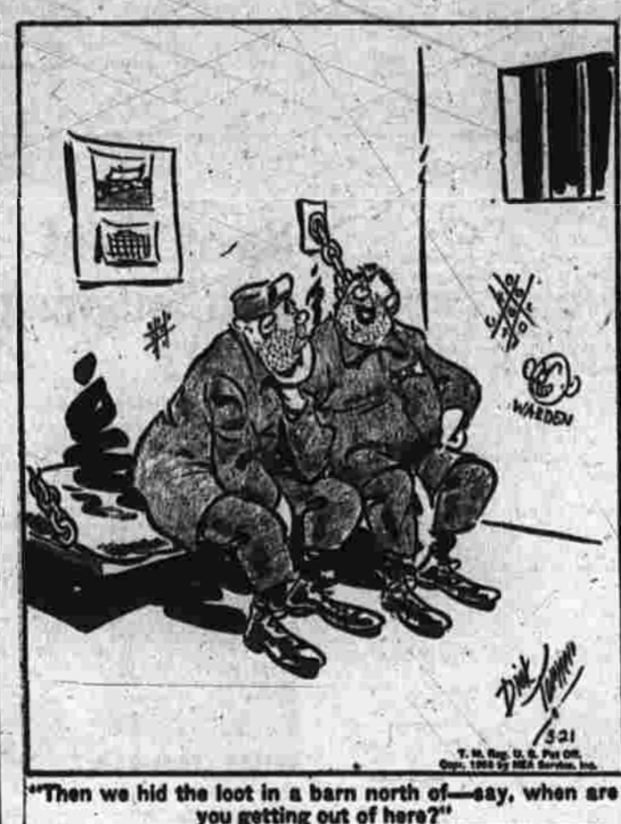
CARNIVAL BY DICK TURNER