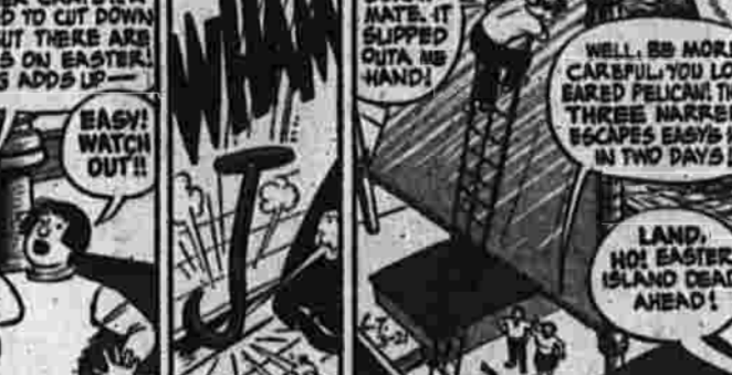
'LEFTY' CELEBRATES