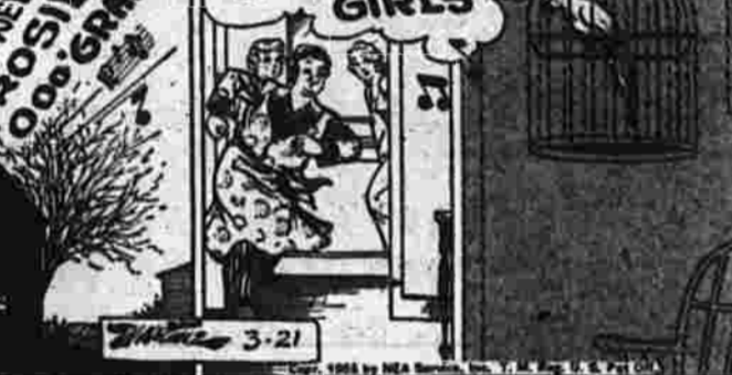
OH, GREAT! BY EDGAR MARTIN