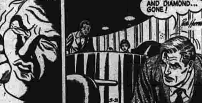
ACCIDENTAL? BY LESLIE TURNER